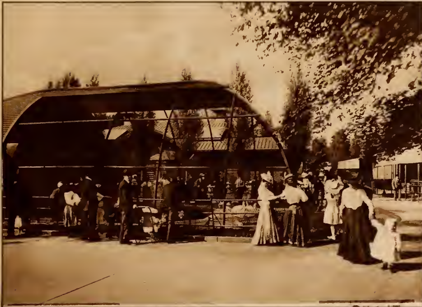
LARGE BIRD CAGE, New York Zoological Garden.